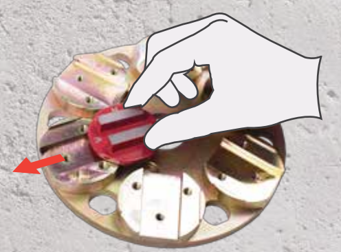
Installing diamond tool in vertical angle

It is the only system that user can select the segment angle. With each segment angle producing different grinding speed and surface finish, user can select the best segment angle for the job at hand.