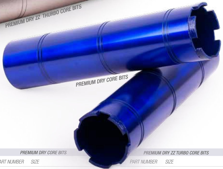
PREMIUM DRY CORE BITS