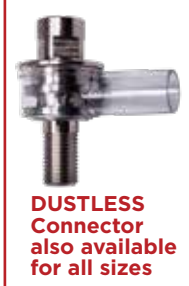
DUSTLESS Connector also available for all sizes