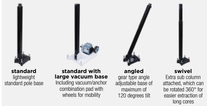
standard lightweight standard pole base