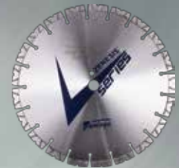
V SERIES PRO BLADE

Patterned diamond V segments for longer life. Designed for fast cutting of reinforced cured concrete.