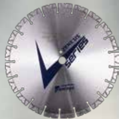
V+ SERIES PRO BLADE

Patterned diamond V segments for longer life. Designed for aggressive wall sawing.